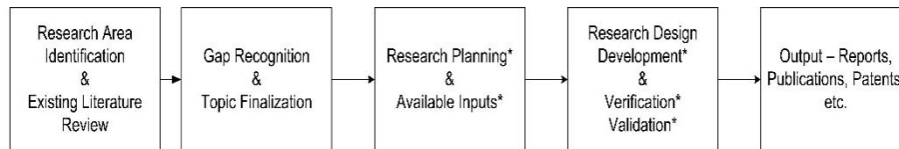
Figure 1: Research Process

Various elements and steps involved in research process are as under(Balakumar, Inamdar, & Jagadeesh, 2013):